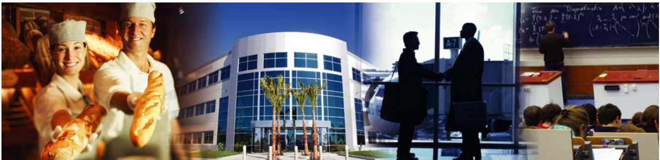
Reception, Restaurant, Financial, Transportation, Amusement, Education, Shopping Mall, Hotel, Government/Public Transportation